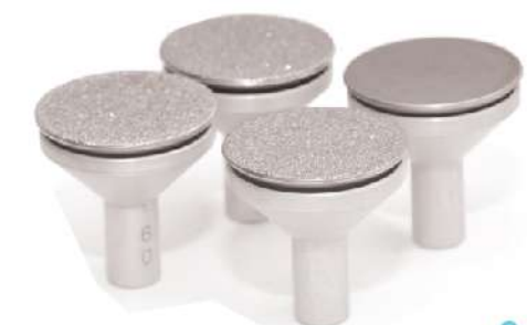
ADJUSTABLE DEPTH DIAMOND BODY TREATMENT HEADS