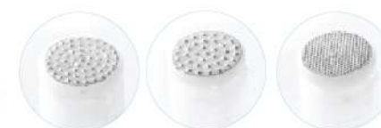
DISPOSABLE STAINLESS STEEL MICROMESH HEADS