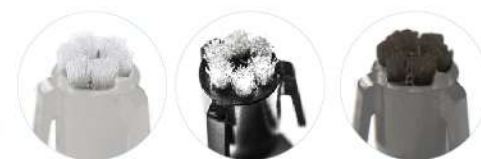
BRISTLE-TIPPED PORE CLARIFYING BRUSH HEADS

New dual-bottle design allows operator to customize treatments by selecting from a variety of serums to target multiple areas of concern. Easily switch between serums without changing bottles to improve efficiency and versatility.