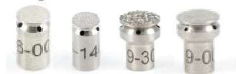
MEDICAL GRADE DIAMOND HEADS